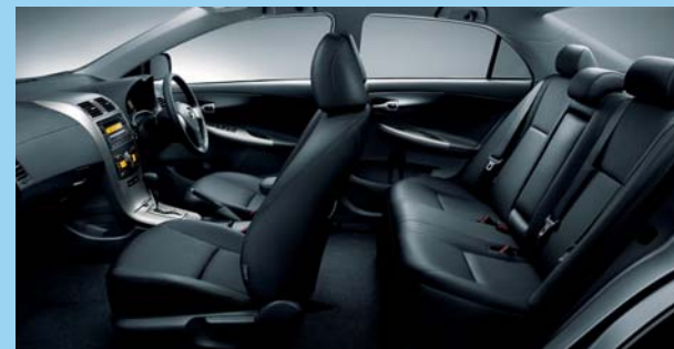
Ultima Sedan interior

Available in three models, from the well-appointed entry level Ascent up through the generously specified Conquest and the top grade luxury Ultima – there's a Corolla Sedan to suit every driver's taste. The Corolla Sedan range boasts superior specifications and option packages, such as MP3 compatible CD player, up to seven SRS airbags and Bluetooth™ technology which allows for hands-free mobile use. (Bluetooth™ available on Conquest and Ultima models only).