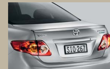
Rear Spoiler Available for Ascent and Ultima only