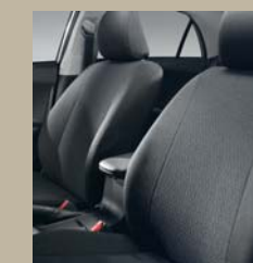
Seat Covers - Dark Grey (front and rear set sold separately) Available for Ascent and Conquest.

Safety warning: Fitment of Front Seat Covers which are not compatible with Front Seat Side airbags may adversely affect Front Seat side airbag deployment and might result in serious injury