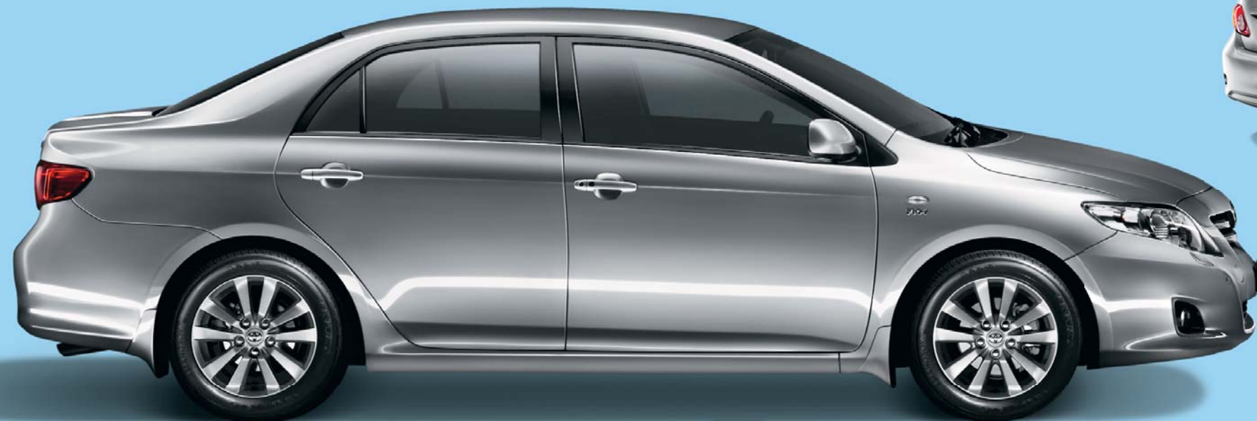
Front cover: Ultima Sedan in Shimmer shown. Above: Ultima Sedan in Silver Pearl shown. Above right: Conquest Sedan in Silver Pearl shown.