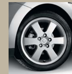
17" x 7" Vortex-V Alloy Wheel