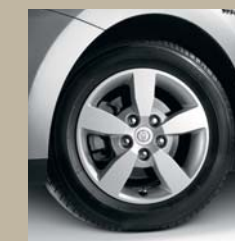
15" x 6.5" Atlas Alloy Wheel Available for Ascent only