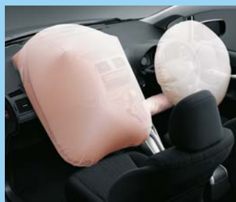
Dual front and driver's knee SRS airbags

With up to seven SRS airbags available on all models (an option on Ascent which comes standard with dual front airbags), Corolla has the most impressive airbag array in its class*. It is also the only car in its class to offer a driver's knee airbag.