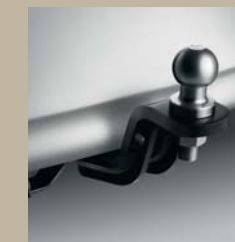
Towbar - 1300kg (braked capacity), Towball and Trailer Wiring Harness (sold separately)