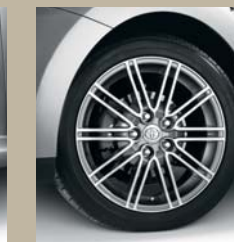
17" x 7" Kappa Alloy Wheel