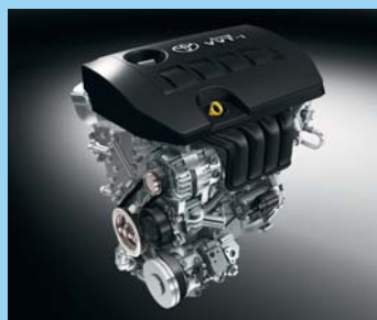
1.8 litre Dual VVT-i engine

Toyota has developed a new 100kW 1.8 litre engine featuring advanced Dual VVT-i (Variable Valve Timing with intelligence) technology delivering excellent acceleration and delivering fuel efficiency and emissions demanded by today's environmentally sensitive buyer.