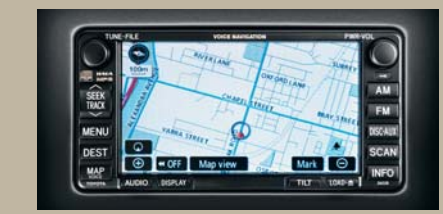
Satellite Navigation* Audio System including 4-In-Dash MP3 CD Changer with Bluetooth™ Communications and (optional) Audio Input