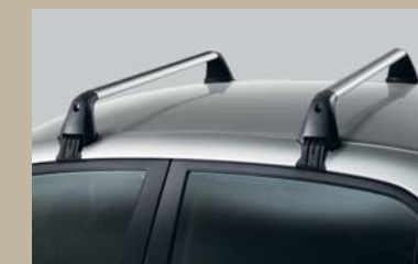
Roof Racks - 2 bar set (75kg maximum capacity)