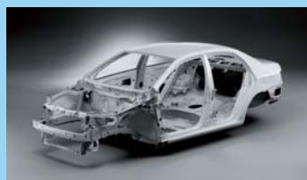
Toyota Safe-T-Cell Sedan

Corolla was designed to exceed the world's toughest crash safety standard as part of Toyota's GOA (Global Outstanding Assessment) program which delivers an advanced collision-safety body structure.