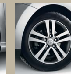
16" x 7" Raptor Alloy Wheel - Machined Finish