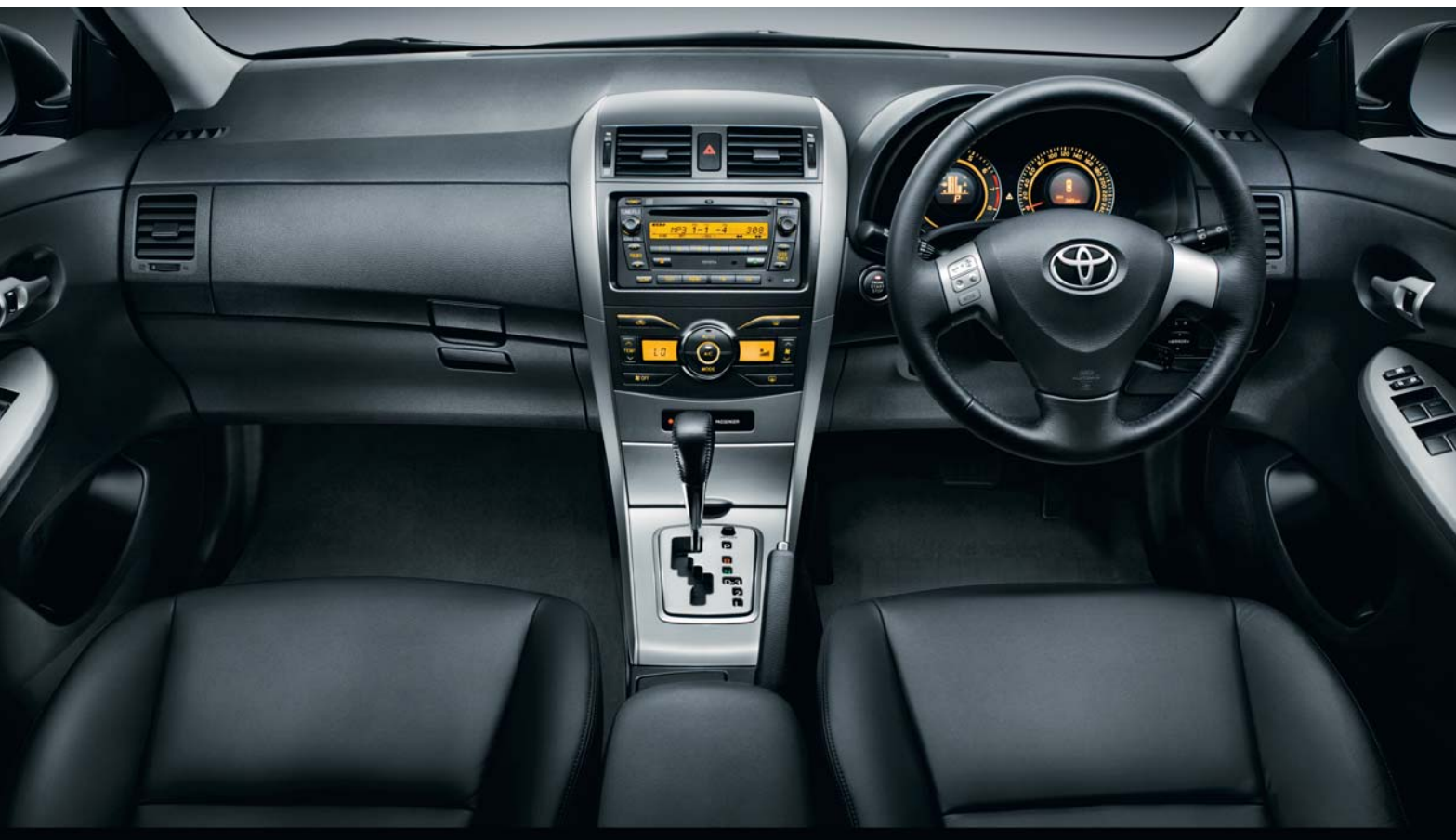
Above: Sedan Ultima interior shown.