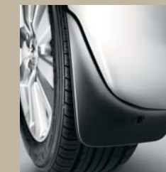
Mud Guard (set of 4) Available for Ascent and Conquest only