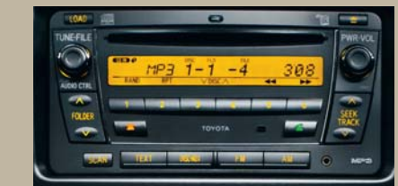
6-In-Dash MP3 Compatible CD Changer and Radio with Bluetooth™ Communications and Audio Input Available for Ascent only