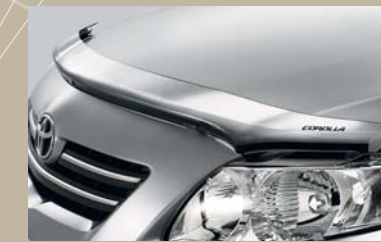
Bonnet Protector and Headlamp Covers (sold separately)