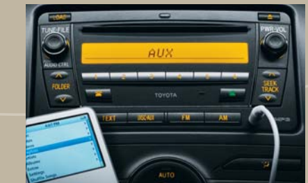
Audio Cable and Car Charger for iPod® Suits all dockable iPods®