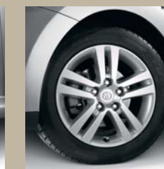
16" x 7" Raptor Alloy Wheel - Painted Finish