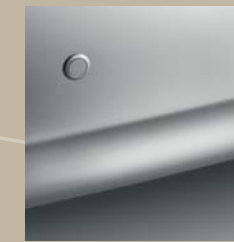
ParkAssist - Reverse Parking Sensors (4 head kit)