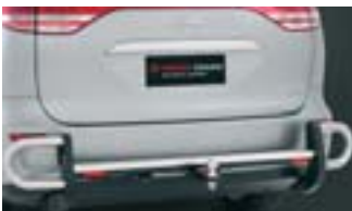
TOWBAR WITH REAR STEP & PROTECTOR, TOWBALL & TRAILER WIRING HARNESS Available on all models (sold separately)

THESE ARE JUST SOME OF THE ACCESSORIES AVAILABLE FOR YOUR TARAGO. FOR A COMPLETE LIST AND FURTHER DETAILS, PLEASE SEE YOUR TOYOTA DEALER OR REFER TO OUR WEBSITE.