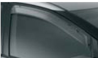
FRONT WEATHERSHIELDS Available on all models