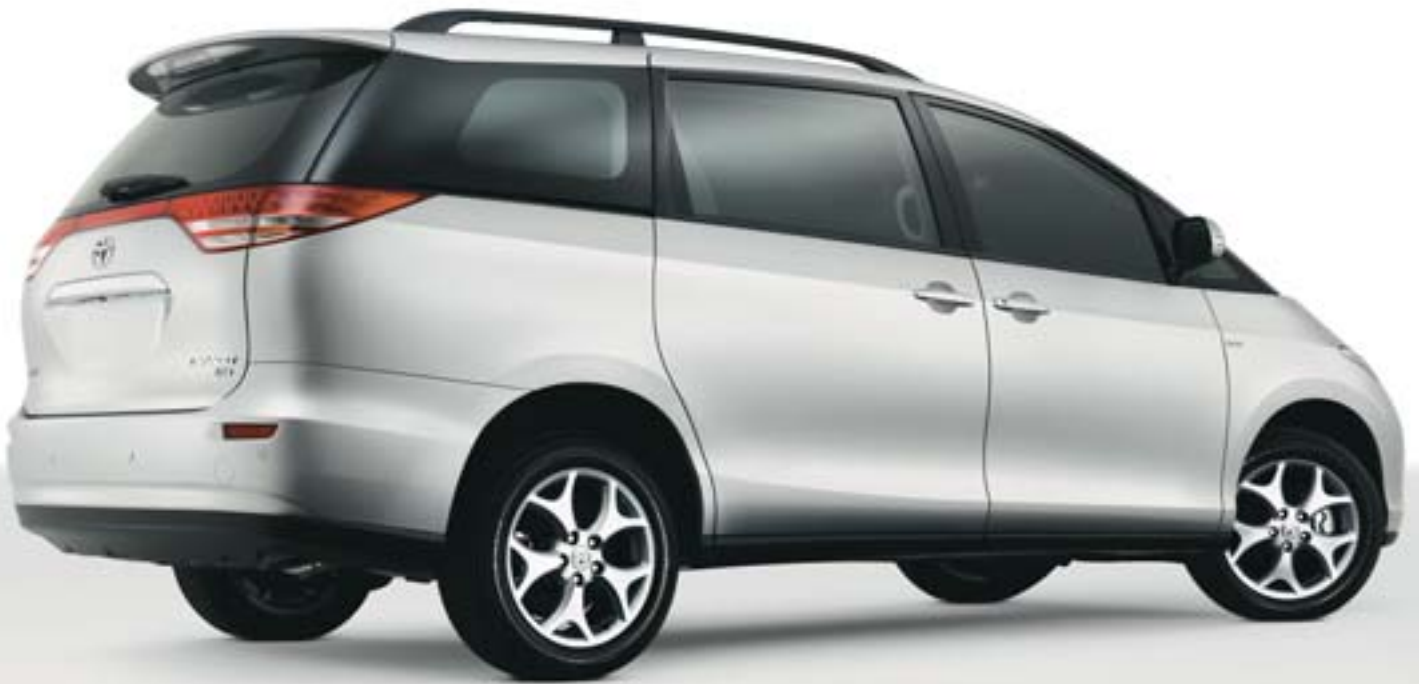
4 cylinder GLX model shown.