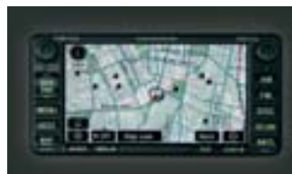
SATELLITE NAVIGATION AUDIO SYSTEM INCLUDES 4-IN-DASH MP3 COMPATIBLE CD CHANGER & RADIO (AUDIO UPGRADE)** Available on GLI and GLX models