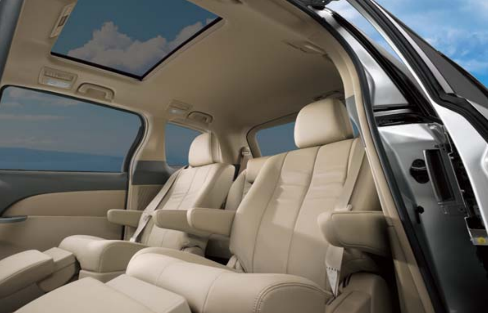
Ultima model shown.