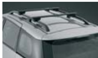
AERO ROOF RACKS (ROOF RAIL TYPE) Available on all GLX models