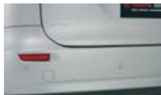
PARKASSIST-REVERSE PARKING SENSOR (4-HEAD KIT) SHOWN ON GLI Available on all GLI models