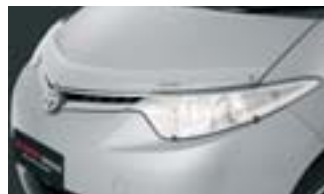
BONNET PROTECTOR & HEADLAMP COVERS Available on all models (sold separately)