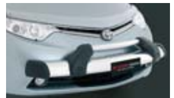
ALLOY NUDGE BAR Available on all models