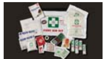
FAMILY FIRST AID KIT Available on all models